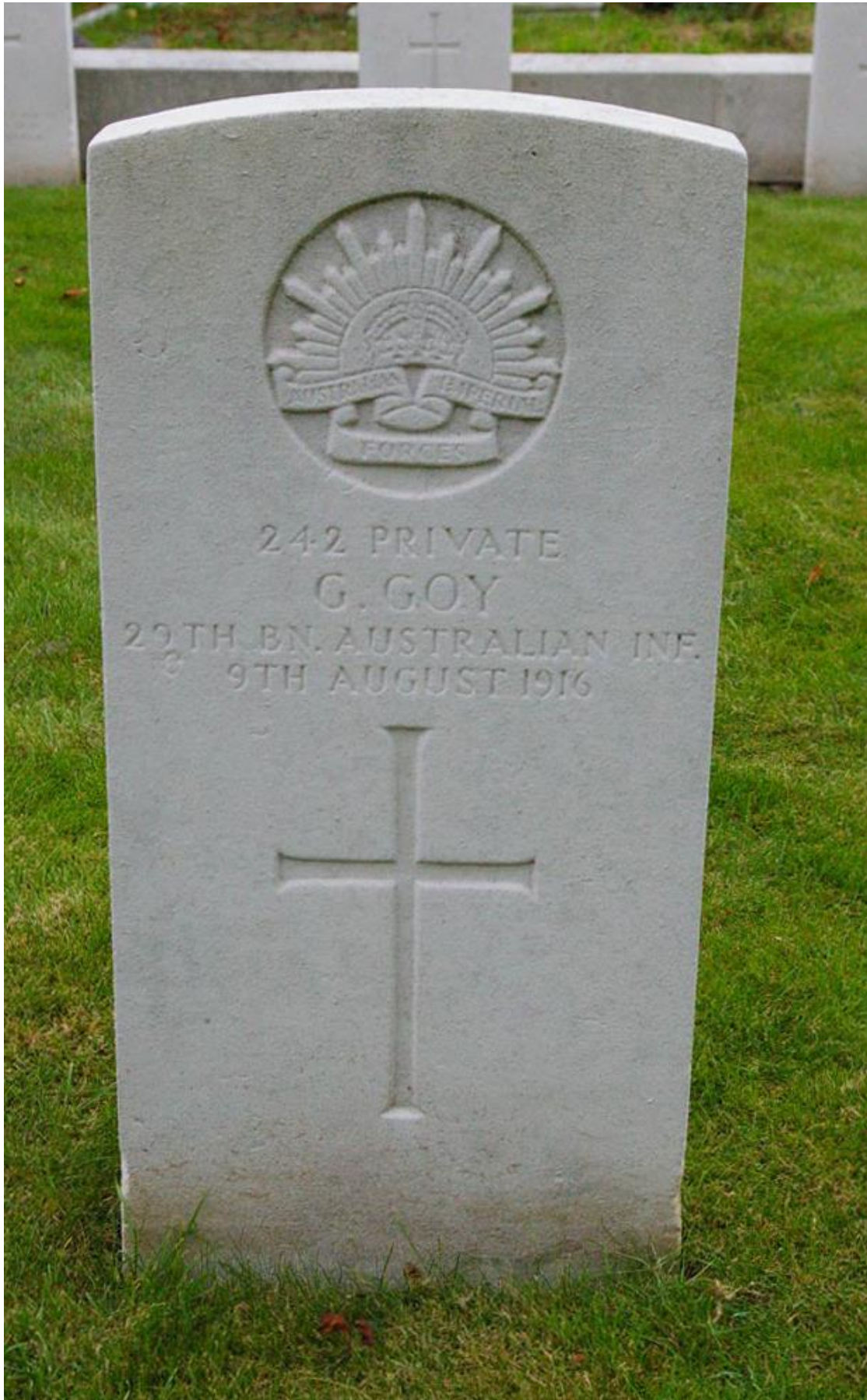
Photo of Private G. Goy's Commonwealth War Graves Commission Headstone in All Souls Cemetery, Kensal Green, London, England.